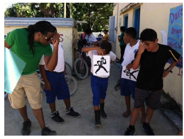
Children from Belize posing like an Ichabod.<sup>TM</sup>

young boy looked pleadingly at me and said, "Will you be my mommy?", "Are you coming back?", "Can you take me with you?".