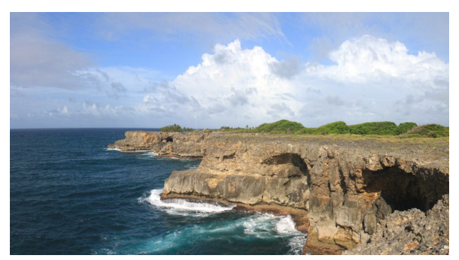
Coastline of Barbados. (WU Faculty-led Program: WU Law Program in Barbados, Summer 2013).

The Study Abroad Photo Essay Contest was established in 2006 to recognize the importance of WU students' international experiences and promote study abroad to other WU students and the community. Congratulations to the 2013 Study Abroad Photo Essay Contest Winners!